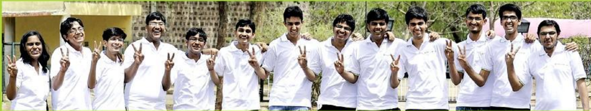
Our Victorious Students from Yearlong Classroom Contact Program (YCCP), who secured All India Rank (AIR) in Top-100 (GEN Category) in IIT-JEE 2011.