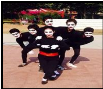
Mime 2 nd in Zonal Youth Festival