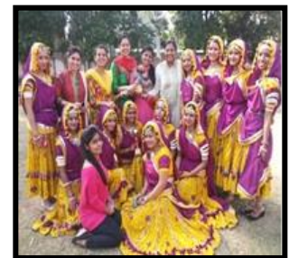
Group Dance 1 st in Zonal Youth Festival