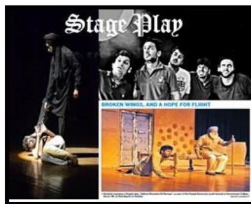
Play 3 rd in Zonal Youth Festival