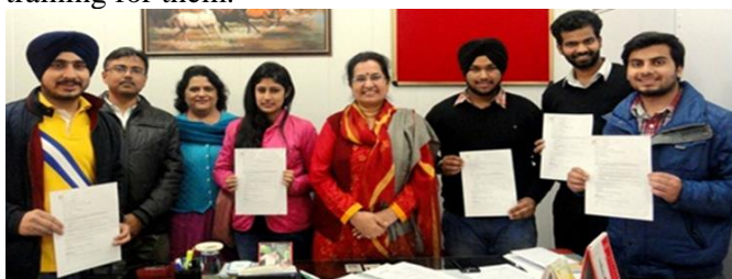
Five students placed with Ernst & Young with annual package worth Rs 280000/-

The vision of the cell is to understand the traits of each student, so that the appropriate placement can be provided to them. The placement cell of the college is more of a Career Facilitation and Personality Development Centre. The purpose of the placement cell of the College is to acquaint the students with the emerging opportunities in the world of work and to impart them sound guidance for an effective career planning. The placement cell hosts on campus pre-placement and placement activities of the corporate world and organizes expert talks on diverse career options. This year NIIT, BULLS EYE and Time Group came for career guidance. The student got placement in many national and multinational companies like Godrej And Boyce, Airtel, Ernst &Young, Genpact, Trident Group, Schneider Electric IBM Daksh, Nimble Solutions Pvt. Ltd, etc. visited campus during placement drive and selected more than one hundred fifty students. The Placement cell also conducts Industrial trips for the Final year students of B.Com and BBA and facilitates summer training for them.