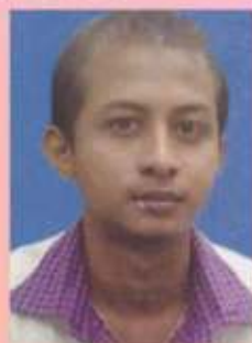
Koustab Bora Dibrugarh, Assam