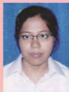
Bhagya Bora Nagaon, Assam