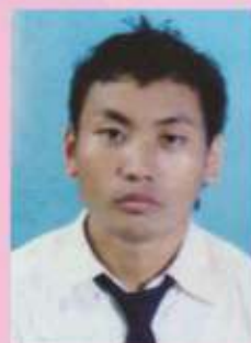
Vungenthung Tungoe Dimapur, Nagaland