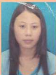
Z. Nzanmongi N. Gulli Wokha, Nagaland