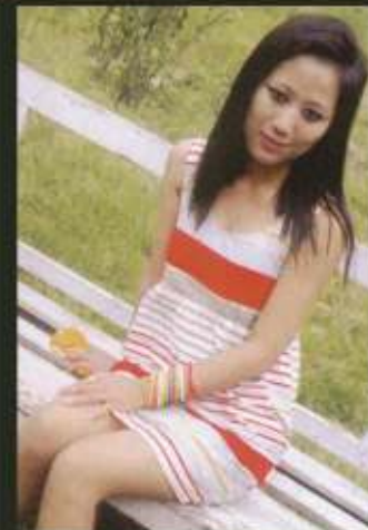
Kaliho Miss Photogenic SUMMER WEAR