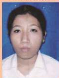
Sunny Difusa Karbi Anglong, Assam