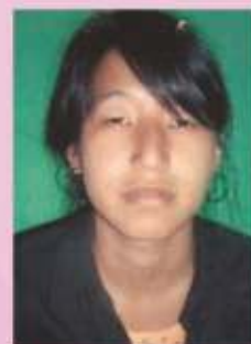
Kechavino Vupru Dimapur, Nagaland