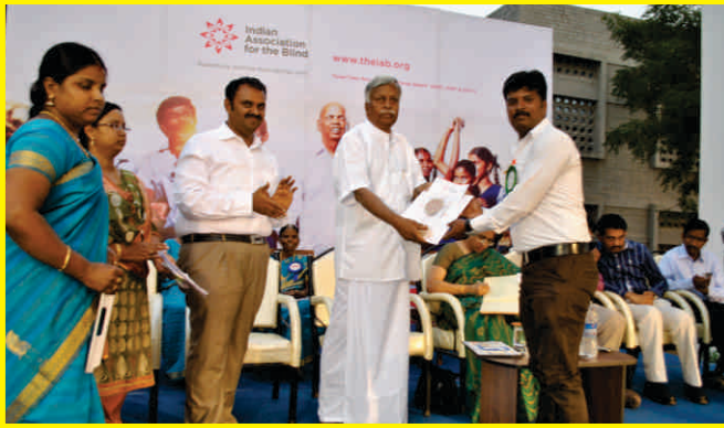
Receiving award from Indian association for blind for the best contribution