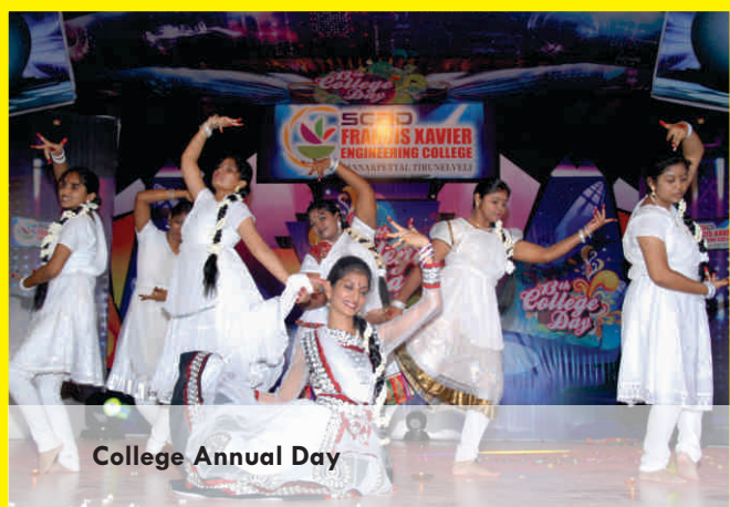
College Annual Day