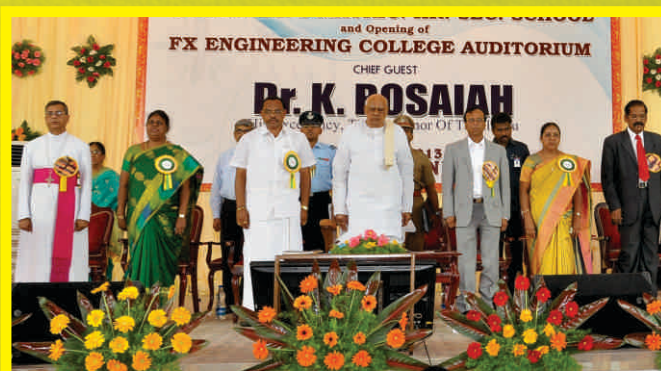
The Governor of Tamilnadu Dr. K. Rosaiah inaugurated the FX Auditorium on 15 th June 2013