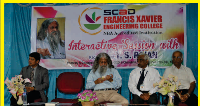
Interactive session with Padmashri. Y.S. Rajan