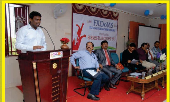
State Level Business Plan Contest was held on 22, March 2013