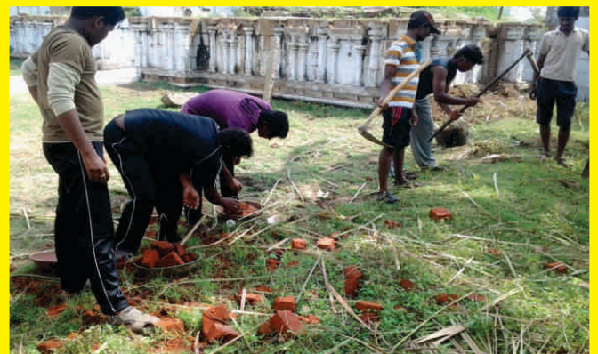
Cleaning the Temple campus