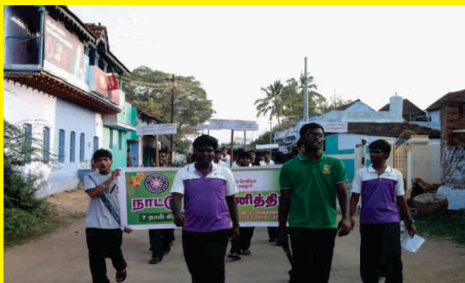
A rally was conducted by the students to spread awareness on AIDS