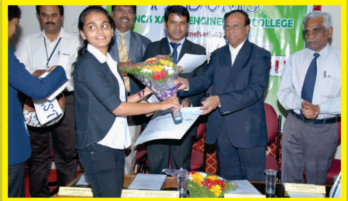
Management Fest was conducted on 22nd February 2013