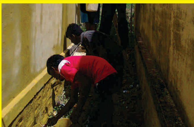
Painting the Government Schools