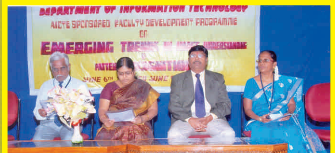
AICTE sponsored Faculty Development Programme on "Emerging Trends in Image Understanding and Pattern Recognition" was conducted from 06-06-2013 to 18-06-2013.