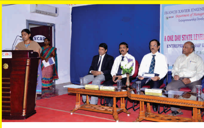
State Level Workshop on Entrepreneurship Development was conducted on 17th May 2013