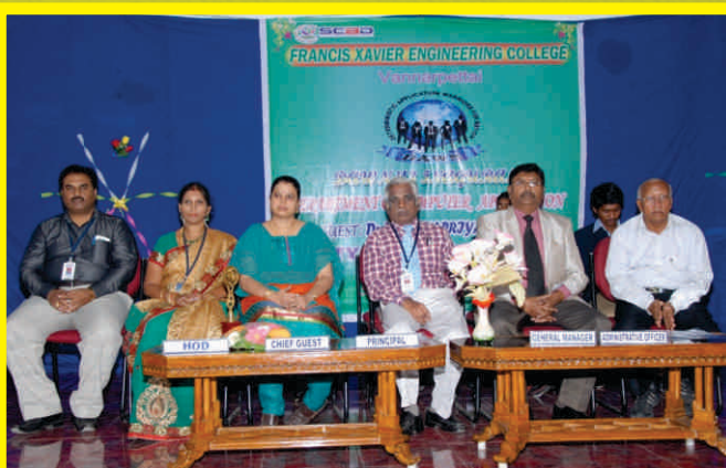
Inauguration of DAWN Association by Department of Computer Application