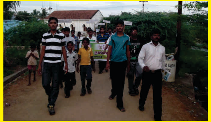
NSS volunteers spreading awareness about dengue fever in Melacheval village.