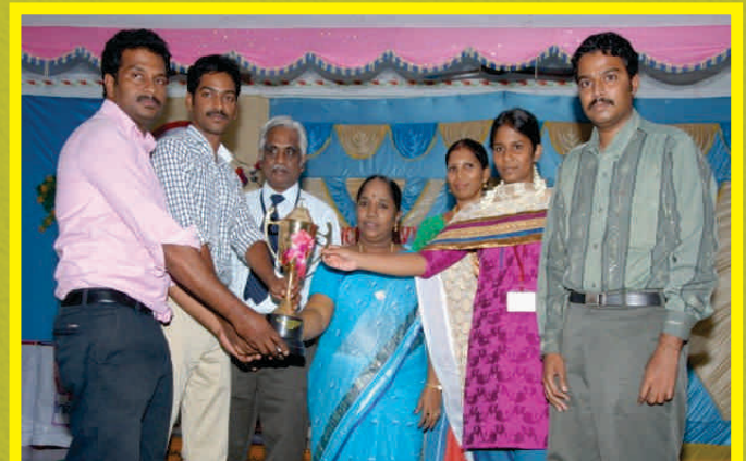
DAWN Association - Winners being awarded