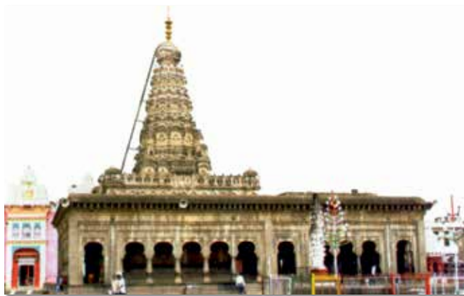
Sri Sharanabasveshwar Temple