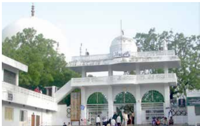
Khwaja Banda Nawaz Darga