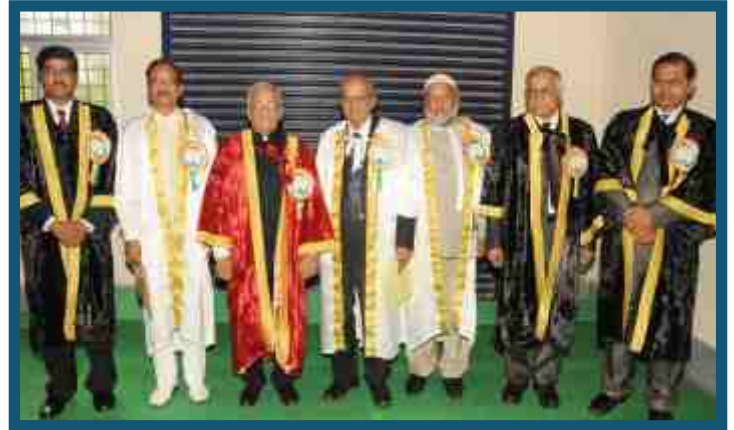
Recipients of Honorary Doctorates at the 33rd Annual Convocation with Officers of the University