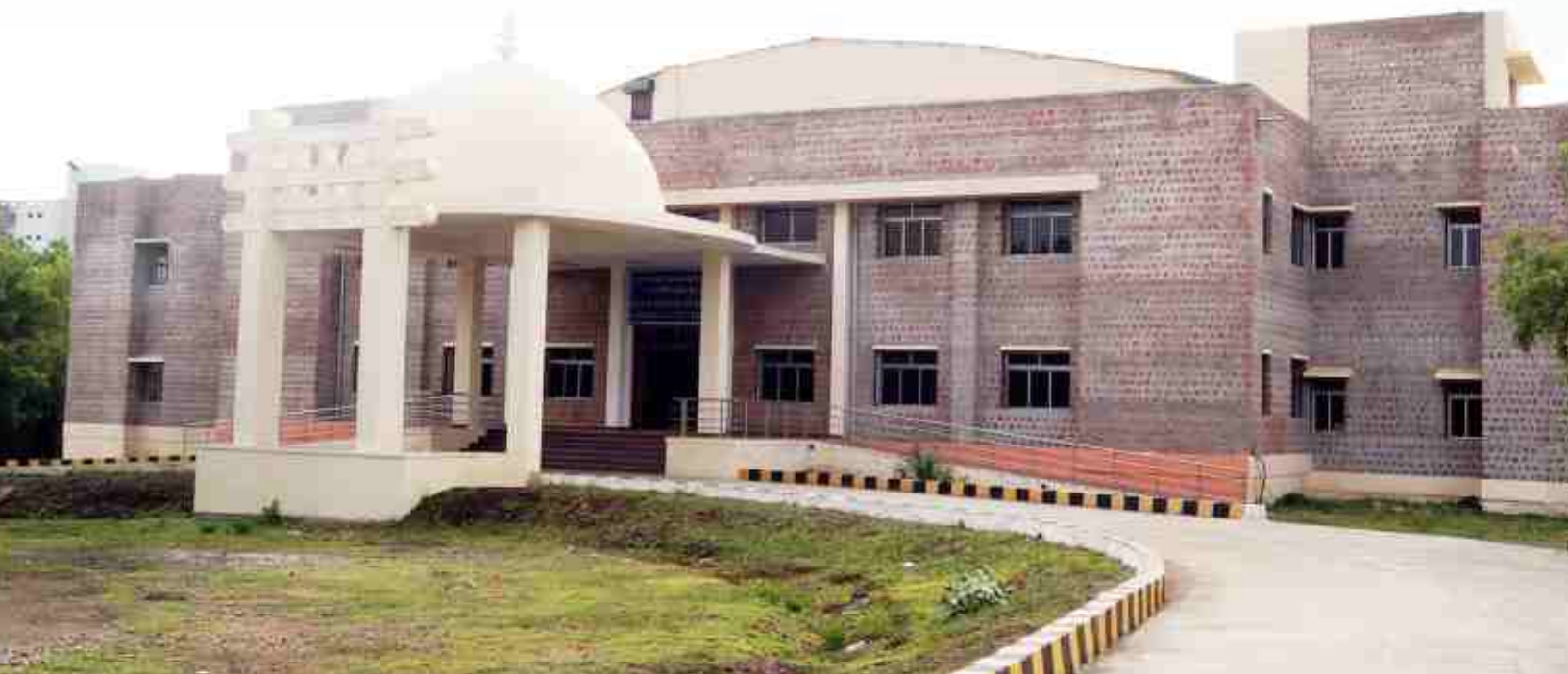
Dr. B. R. Ambedkar Bhavan