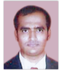
Sri George Fernandes Member