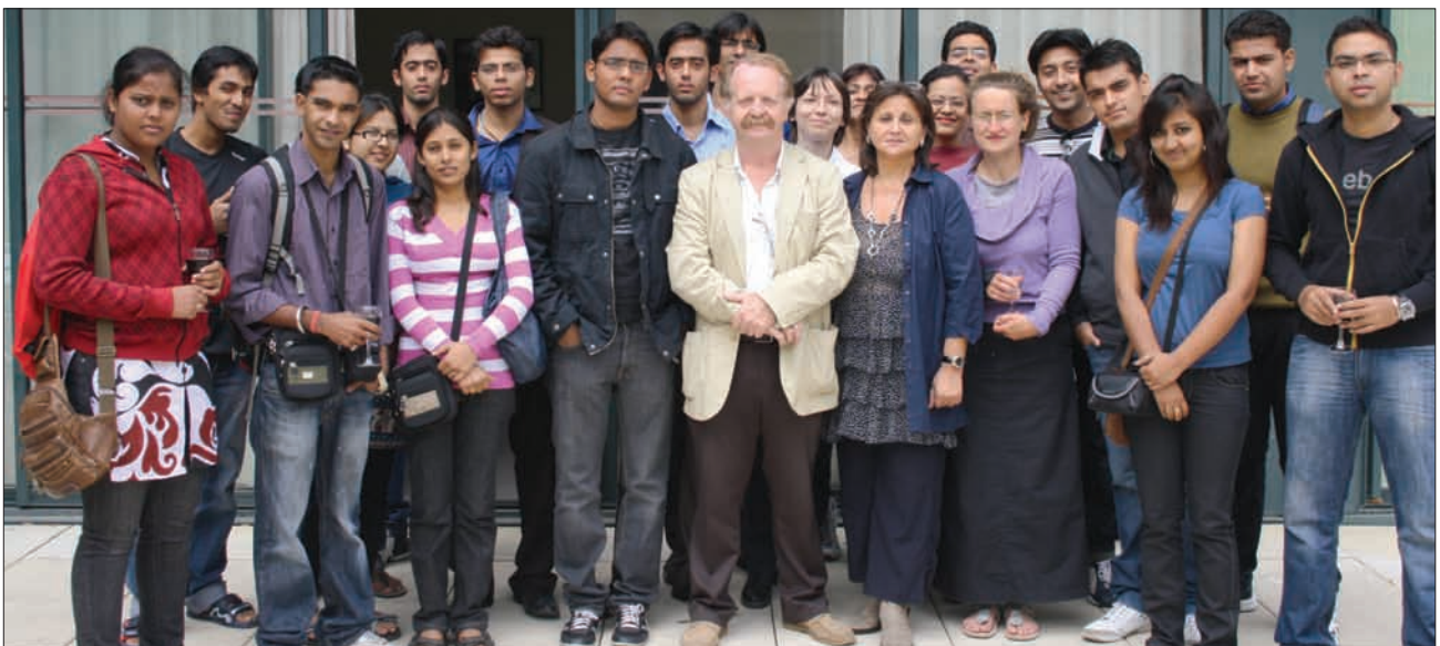
NIILM CMS students trip to Poitiers, France

NIILM-CMS encourages industrial visits for its students, in order to enable students gain practical insight on workings of varied industries. In addition, the students undertake project studies which help them in gaining first-hand experience in current practices and philosophy. The project study provides a vehicle for integration of learning of functions across disciplines.