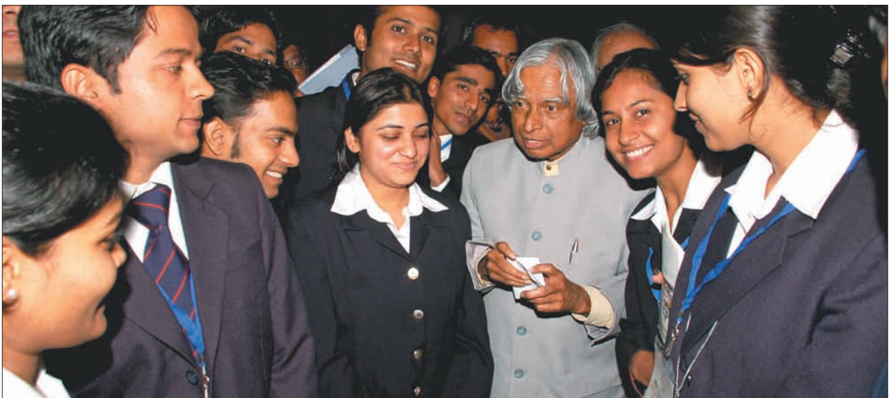
EMPI students with former President of India Hon'ble Dr A.P.J Abdul Kalam

was Rs 479,000 p.a. Some of the companies that came to the campus for the placements include HDFC, RBS, Axis Bank, Capital IQ, Deloitte, TIME, Shine.com, HCL Tech, Nestle, HLL, Daink Jagran, Hitachi, GATI, Matrix and Philips among others.