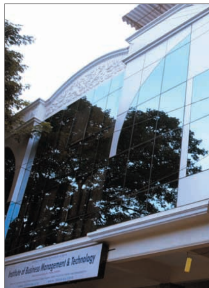
IBMT central administrative block

The Institute has a tie up with Entrepreneurship Development Institute of India, offering its Diploma Programme on Entrepreneurship Development. IBMTs also has a tie up with Christian Council for Financial Accountability & the Institute of Home Finance to provide academic support in the areas of financial management. IBMT is a part of a global network of B Schools comprises of 116 B Schools across the globe.