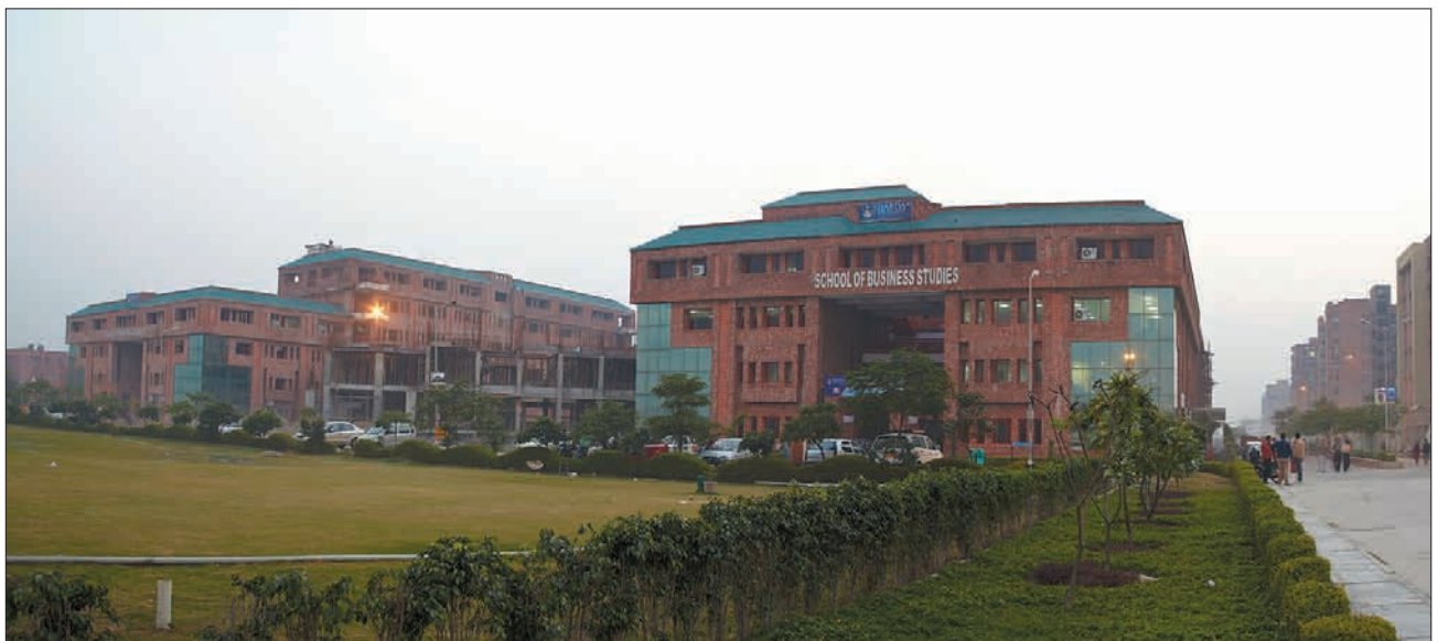
Sharda University Campus

salary offered to students placed in domestic private companies was Rs 5,00,000 p.a. and in international companies was US$ 30,000 p.a. Some of the companies that have hired students include HDFC bank, American Express Bank, ICICI bank, Citi bank ITC Ltd, Future group, HUL, Audi, VIP, LG, Philips, Pepsi Co., Good year, Naukri, Olympus, UFlex, Cargil, Anik group, TCI, F1F9 Everest metals, Metafrigue, etc.