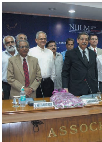
Banking seminar organised by NIILM CMS