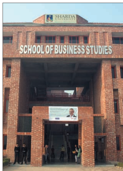
School of Business Studies

The library at Sharda University is well equipped with more than 26,000 books. The institute has also subscribed to DELNET and other internet