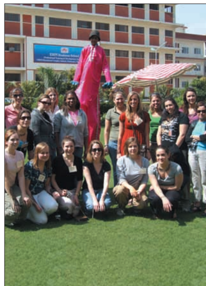
Foreign students at EMPI Campus

EMPI is a fully residential institute and provides separate hostel accommodation facility for both boys