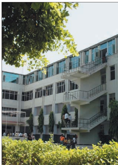
DAV Institute of Management, Faridabad

DAVIM-DBS has excellent infrastructural facilities that include computer laboratories, free internet, a library with computerized catalogue and issue systems, a seminar hall and classrooms equipped with audio-visual gadgets. The institute has 8 classrooms with a total intake capacity of 120 students per batch dedicated to MBA Programme of Department of Business Studies. Also, the institute has three computer labs consisting of 60 computers per lab supported by high-end equipment's and latest software's dedicated to the programme.