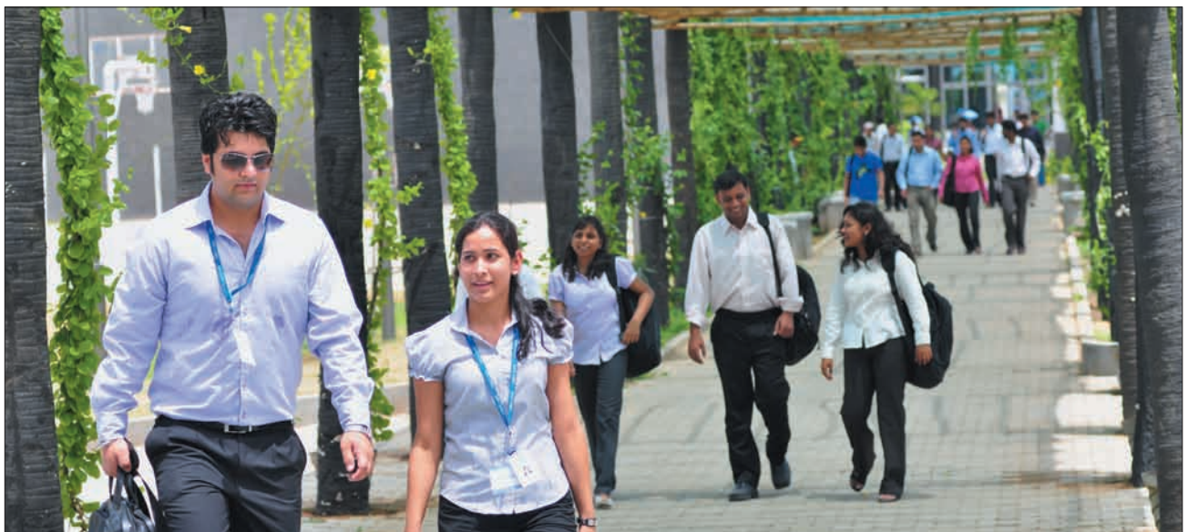
Transforming Careers - Great Lakes

Great Lakes campus placement activity witnesses a host of companies from various sectors to hire students. In 2011, there was a 100% placement with an average salary of Rs 945,000 p.a. During 2011, companies from IT, BFSI, consulting and FMCG sectors visited the campus for recruitment. Some of the major domestic companies where the students got placed include HSBC, HDFC, Infosys, Tata Motors, KPMG and Godrej among others.