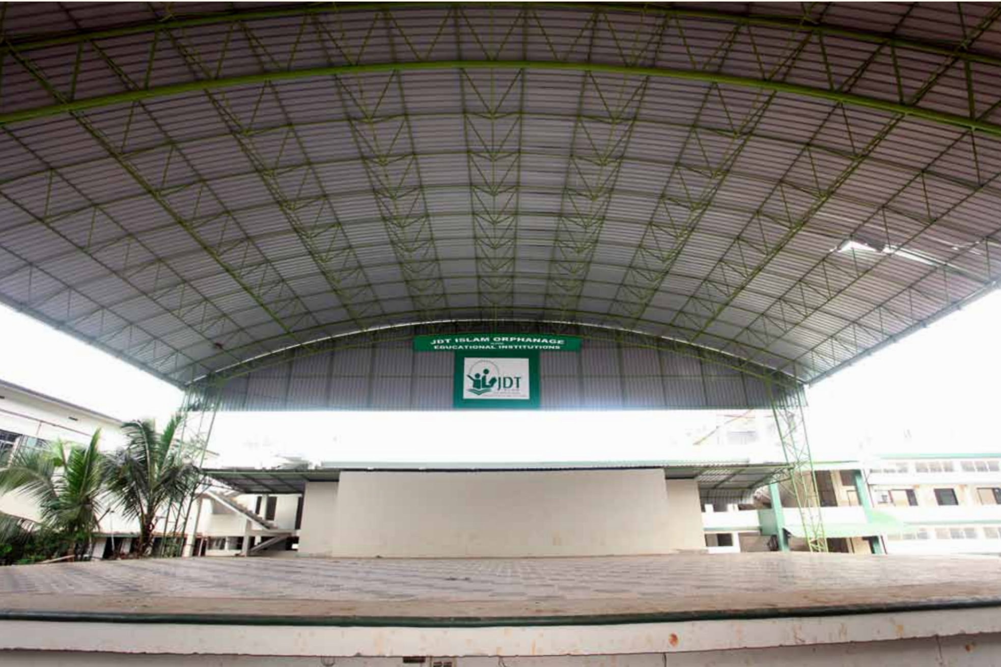
JDT Islam Open Air Theater