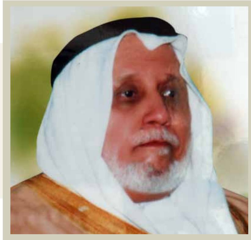
Late. Dr. Mohammed Abdu Yamani. (President Iqraa Charitable Society)

Dr. Mohammed Abdu Yamani, a renowned social identity and literary figure is having vast arena of professional records as Demonstrator (Faculty of Science, Riyadh University) to the Minister of Information during the period 1975 to 1983 and the VP Dalian Albaraka Group from 1984 to till date. Besides the Chairman of many reputed companies and charitable institutions he is having permanent membership in various Universities and charitable organization. He has won many medals and certificates for his dedication and hard work in every endeavour he has taken up. He has published books and had done researches on Economics, Geology and Mineral Resources.