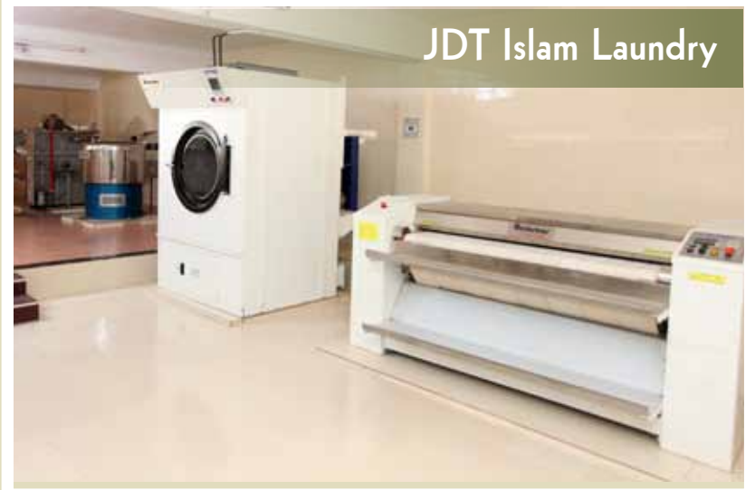
JDT Islam Laundry