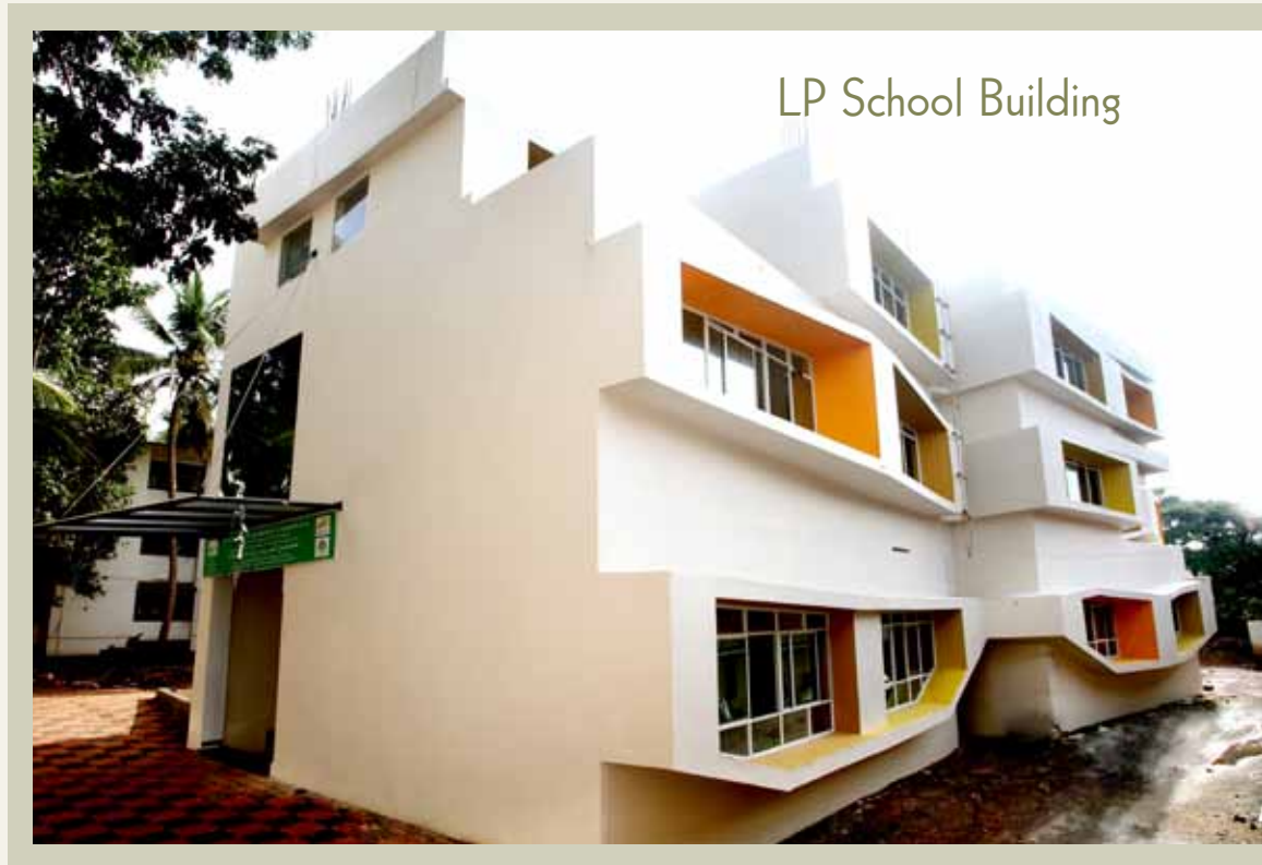
LP School Building

A team of qualified, experienced and well trained teachers render their dedicated and uncompromising service to mould and shape the new generation of tomorrow. The institution is attempting to create a hallmark by incorporating new initiatives and innovations in the field of education by means of its methodologies and practices. The student friendly environment existing in the school ensure every kid learns everything they are taught.