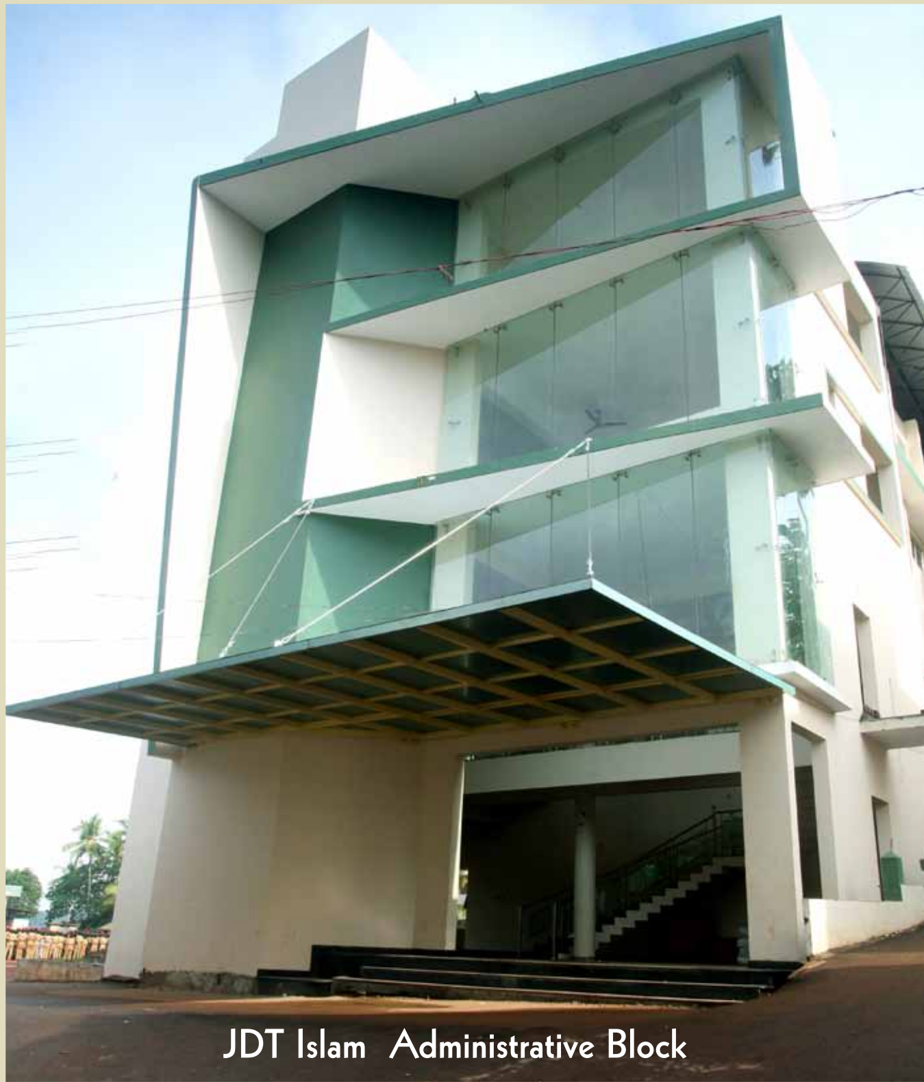
JDT Islam Administrative Block