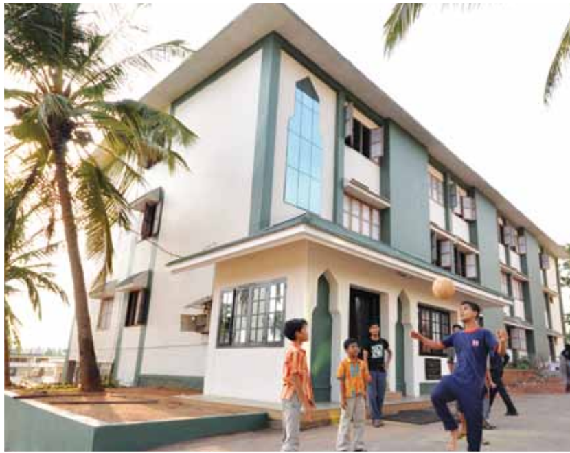
Jb: Abdulkhaliq Al Nouri hostel for boys