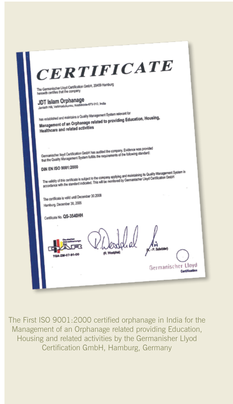
The First ISO 9001:2000 certified orphanage in India for the Management of an Orphanage related providing Education, Housing and related activities by the Germanischer Lloyd Certification GmbH, Hamburg, Germany

Backed by its professionalism, coupled with the experience and expertise, the institution has completed its eight long and glorious decades of yeoman service for the welfare of humanity, at large. It is really noteworthy to mention here, that with the single-minded devotion and unflinching effort, the organization was able to teach, transform and assist as many as 20,000 orphans, as its inmates, presently, who lacked the means to live and lead a normal life, as well as, ease and smoothen out their thorny paths in life. The institution also received the first ISO 9001:2000 Certification for Orphanage in India, particularly for its management, relating to the provision of education, housing and connected activities, from the Germanischer Lloyd Certification GmbH, Hamburg, Germany.