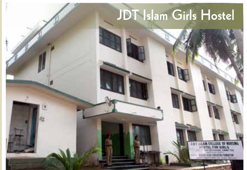
JDT Islam Girls Hostel

JDT ISLAM COLLEGE OF NURSING HOSTEL FOR GIRLS JDT ISLAM EDUCATION FOUNDATION