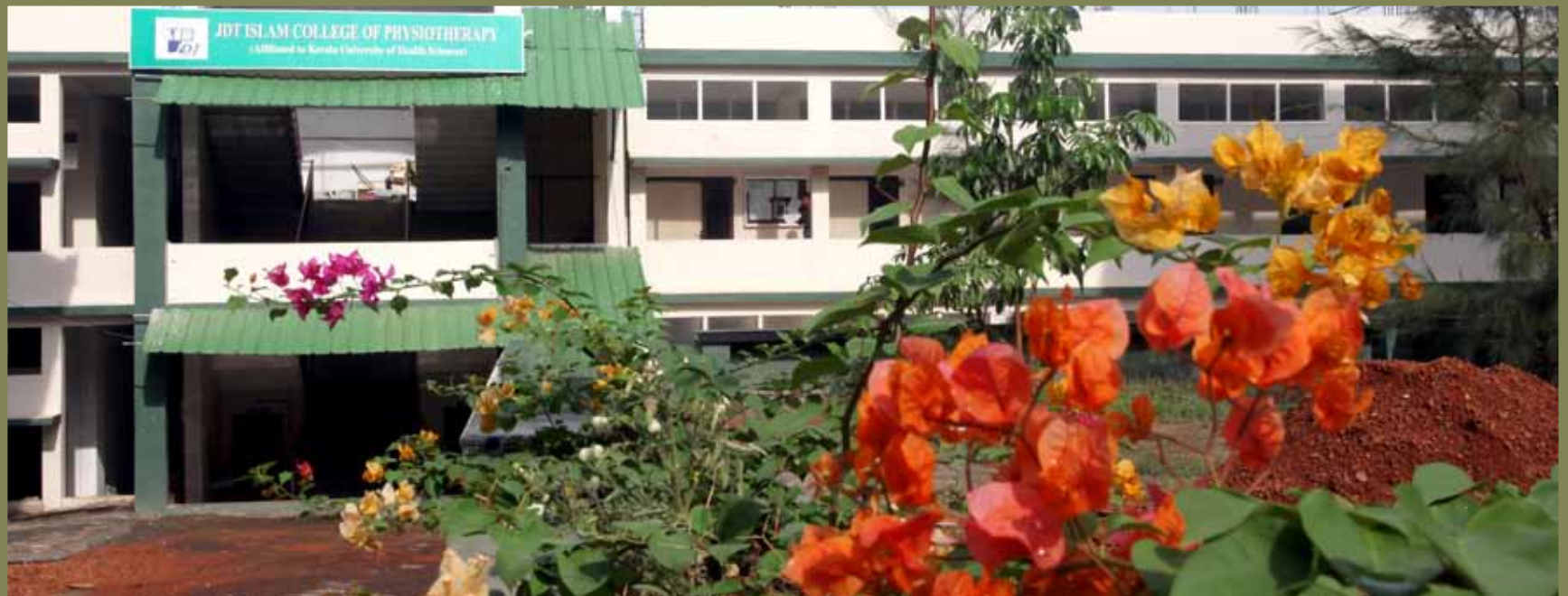
JDT Islam College of Physiotherapy