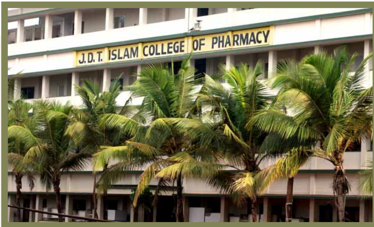
JDT Islam College of Pharmacy