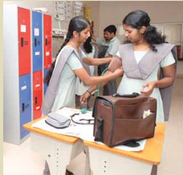
College of Physiotherapy